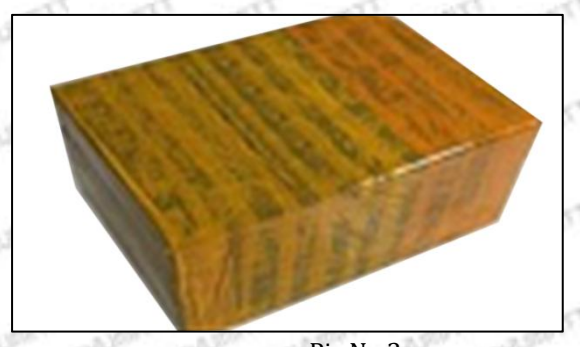
Pic No.3 International express packaging: Wrapped with yellow tape after wrapping black protective film

Mob/Whatsapp: +86 13410541523 Tel: +8675523215133 Email: ruby@shumatt.com Website: www.shumatt.com